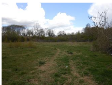
South eastern section of the site facing north