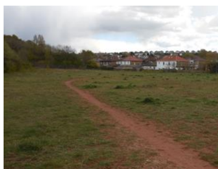
Northern section of the site facing southeast