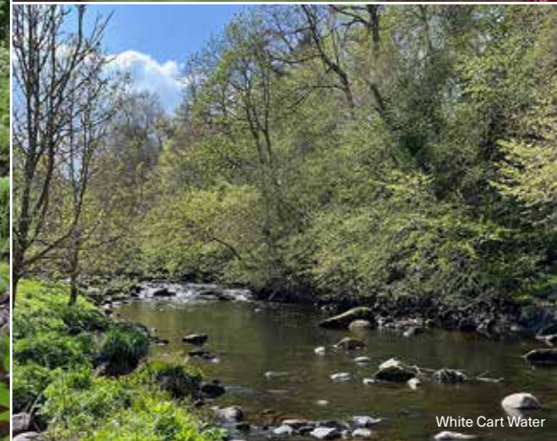
White Cart Water