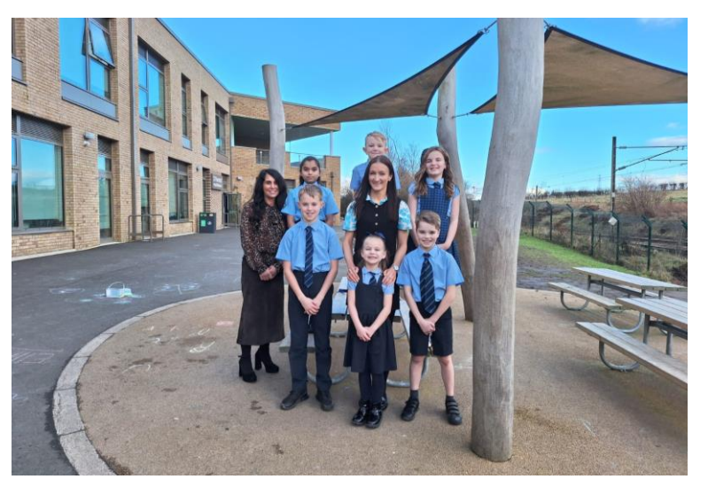
St Thomas' received glowing inspection report.

Williamwood pupils celebrate exam success.