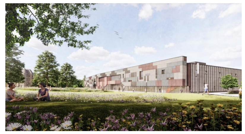
Main construction phase due to start later this year.