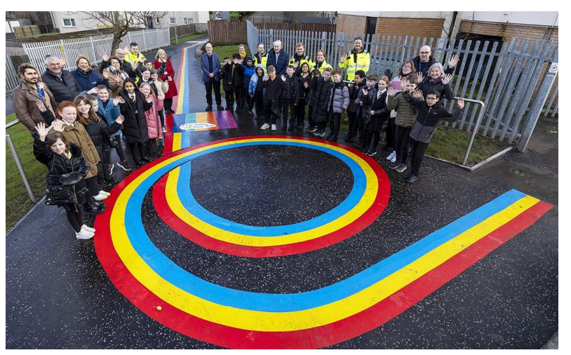
Thornliebank Lanes project.

Work will start soon on new Balgray Station.