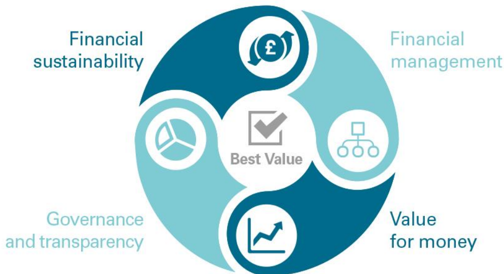
Exhibit 1 Audit dimensions