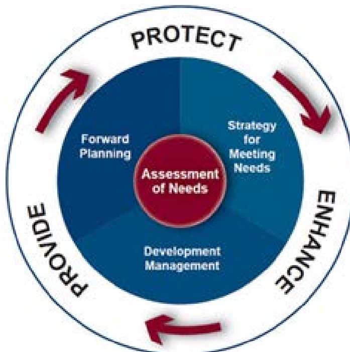
Figure 1: Planning objectives - Protect, Enhance and Provide

Aim 3 - To provide new playing pitches where there is current or future demand to do so.