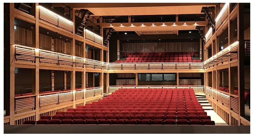
Design team looking at new theatres across the UK