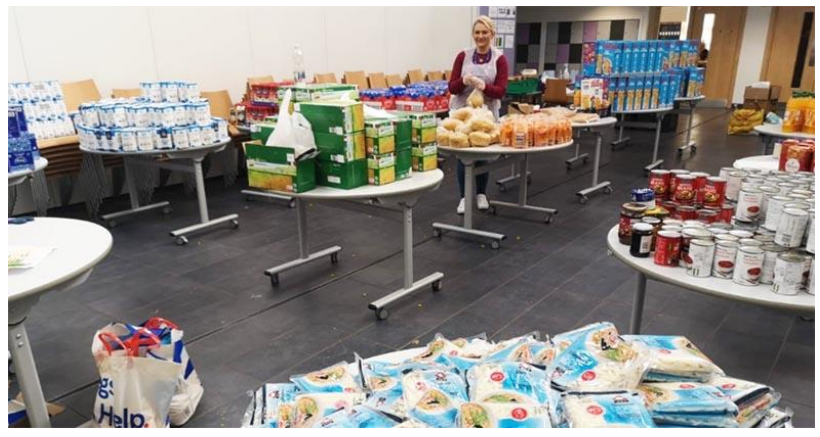
Humanitarian hub distributed food parcels