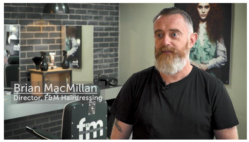
Shop Local campaign promoted firms