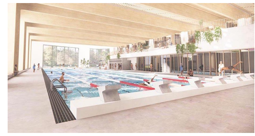
New leisure centre includes a 50m swimming pool