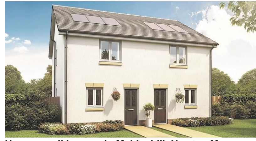
New council houses in Maidenhill, Newton Mearns