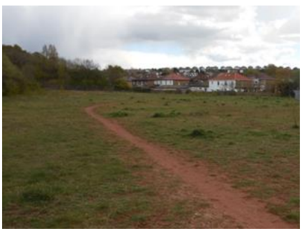
Northern section of the site facing southeast