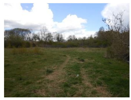
South eastern section of the site facing north