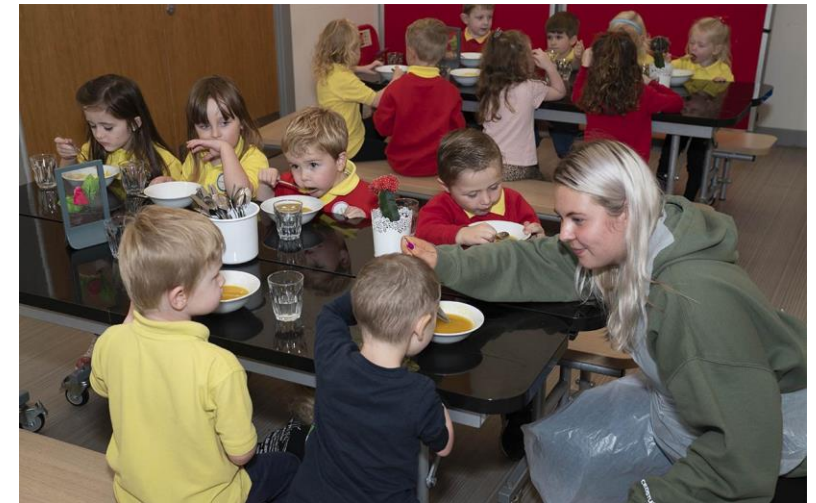
Time for a healthy lunch at Arthurlie Family Centre.