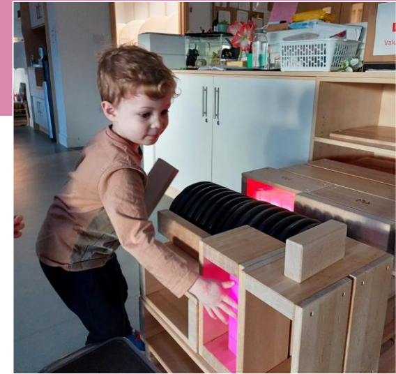
Enjoying superb facilities at Overlee.