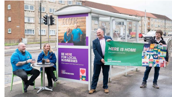
Campaign promoted local businesses.