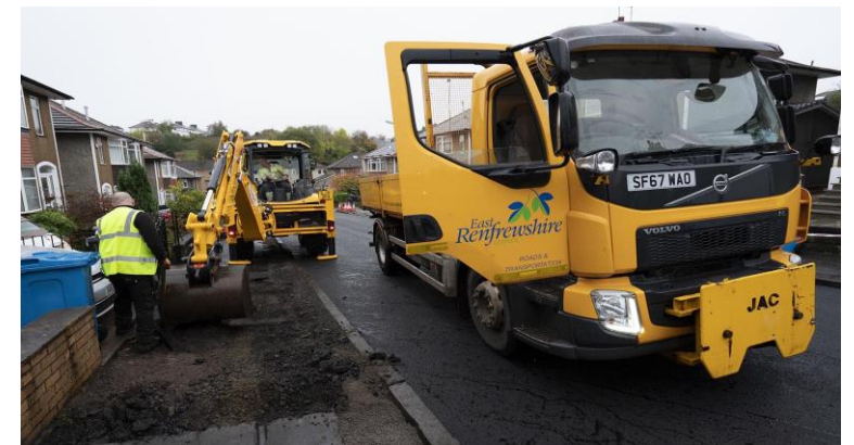
128 roads and pavements resurfaced.