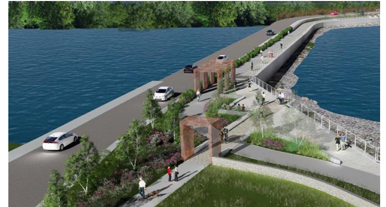
How stunning new Dams promenade will look.