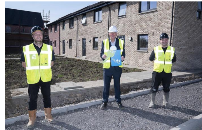
New council houses in Barrhead.