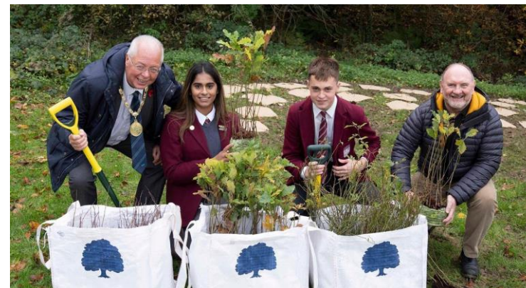
Trees planted across East Renfrewshire.