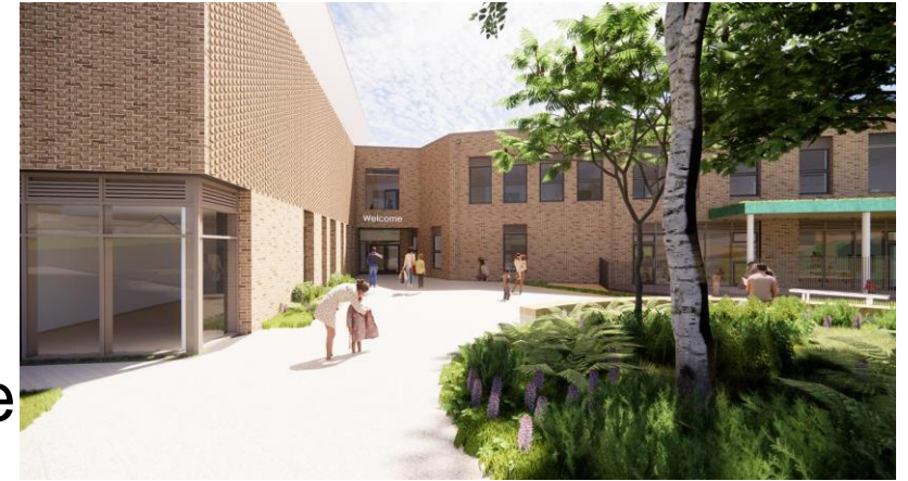
Artist's impression of new schools in Neilston.