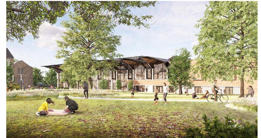
How new leisure centre will look.