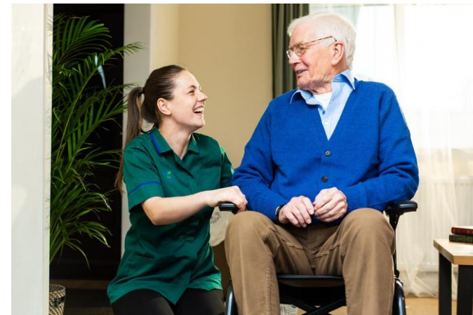
More staff for our vital Homecare service.