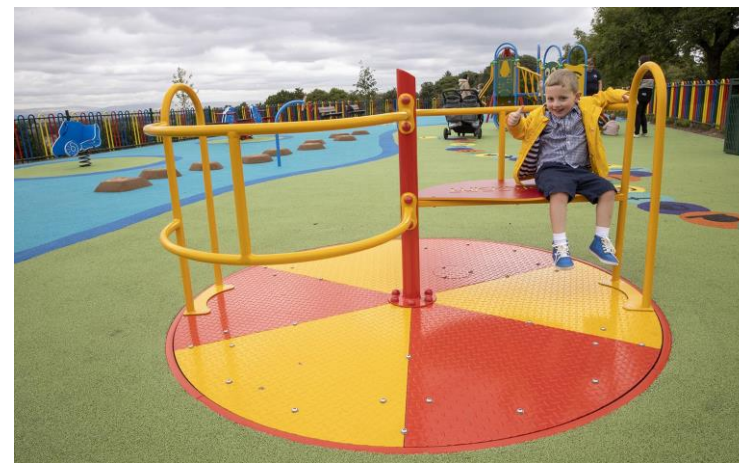
Upgraded Fairweather Park.