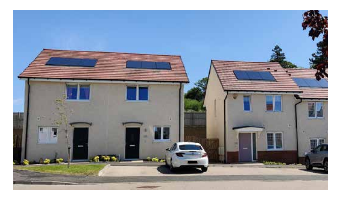
2 The Director of Environment has delegated authority and flexibility to negotiate and agree an affordable housing package in relation to each application and to secure it through planning condition(s) or legal agreement(s) as appropriate

It will be at the discretion of Council staff to determine and secure the most appropriate form of contribution for each particular case, taking all matters, including development viability, into account and ensuring that the solutions agreed will meet housing needs and be affordable to those on modest incomes<sup>2</sup>.