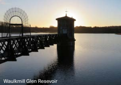
Waulkmill Glen Reservoir