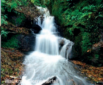
Waulkmill Glen waterfall