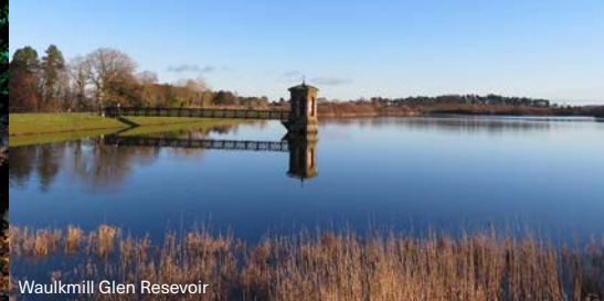
Waulkmill Glen Reservoir