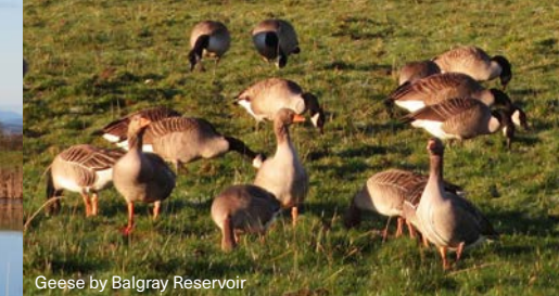
Geese by Balgray Reservoir