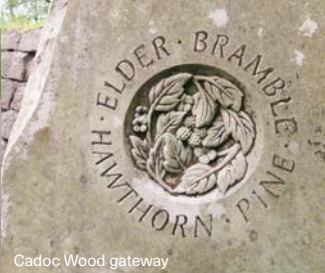
Cadoc Wood gateway