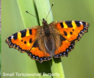
Small Tortoiseshell Butterfly