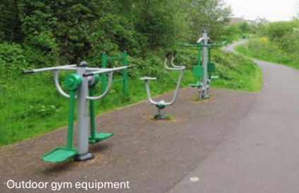
Outdoor gym equipment