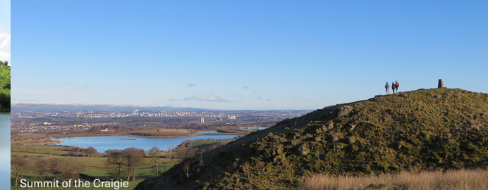
Summit of the Craigie